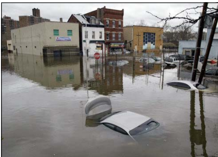
Flood waters covered many roads including Tyler Street and Bridge Street in Paterson, New Jersey

This storm was definitely one for the record books in terms of time of season, strength, snowfall and flooding.