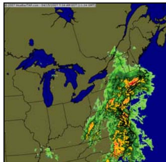
Reg. Radar from WeatherTap 4-15-07 at 7:34 AM EDT

What was very impressive with this storm was how strong and deep the low pressure center became. Typically, with a Nor'easter, the coastal low rapidly develops, becomes quite strong and moves off the coast. During this storm, there was a steady strengthening with the low until it reached its peak intensity over Long Island at 969 millibars (millibar is the standard way of measuring atmospheric pressure in meteorology). To get a sense of a how strong the low was, many category 2 hurricanes